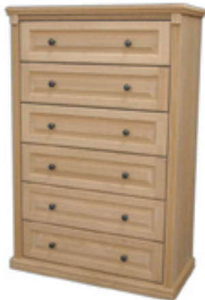
LM_1206 Chest of Drawers