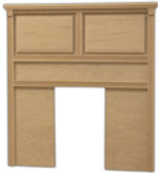
LM_1050/T Twin Headboard

All modules are available in a variety of woods, many different styles, doors and your choice of hardware— Please see the Components section under Components tab in this catalog.