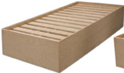
Liberty Modular Captain's Platform bed available in Twin, Full, Queen and King. No drawers.

BD_CAP/T 77"L x 41"W x 15 1/4" T BD_CAP/F 77"L x 57"W x 15 1/4" T BD_CAP/Q 82 1/2"L x 62"W x 15 1/4" T BD_CAP/K 82 1/2"L x 79"W x 15 1/4" T