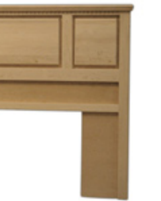
LM_1050/Q/XT Queen Headboard Xtra tall