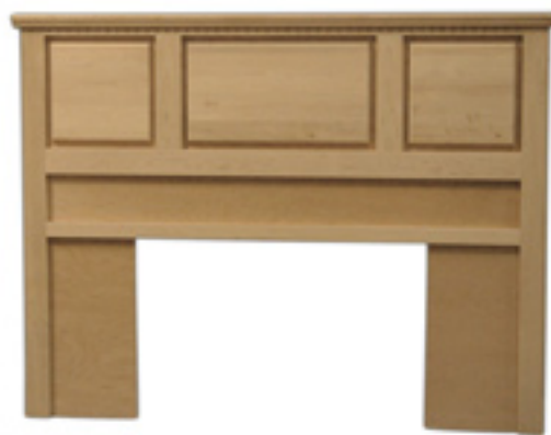
LM_1050/K King Headboard