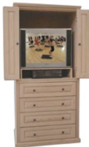
LM_1004 TV Armoire with Bi-Fold Doors