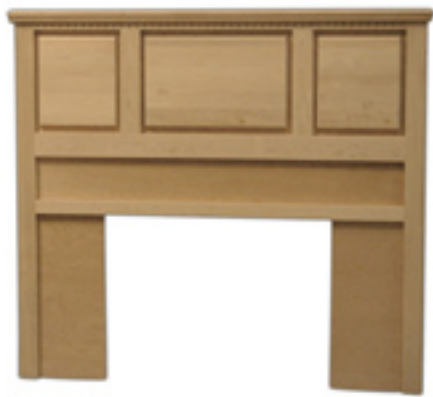
LM_1050/Q Queen Headboard