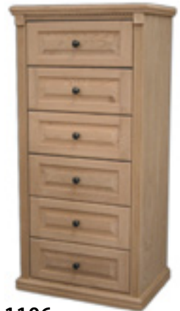
LM_1106 Lingerie Chest