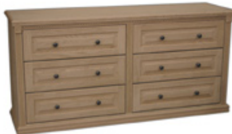
LM_1306 Double Chest of Drawers