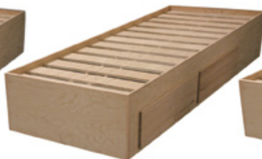
Liberty Modular Captain's Platform bed available in Twin, Full, Queen and King with 2 drawers on one side.

BD_CAP/T 77"L x 41"W x 15 1/4" T BD_CAP/F 77"L x 57"W x 15 1/4" T BD_CAP/Q 82 1/2"L x 62"W x 15 1/4" T BD_CAP/K 82 1/2"L x 79"W x 15 1/4" T