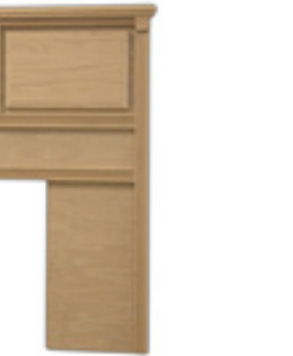
LM_1050/T/XT Twin Headboard Xtra tall