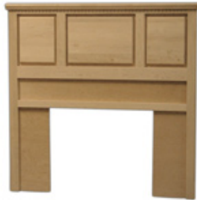
LM_1050/F Full Headboard