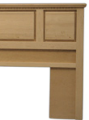
LM_1050/K/XT King Headboard Xtra tall