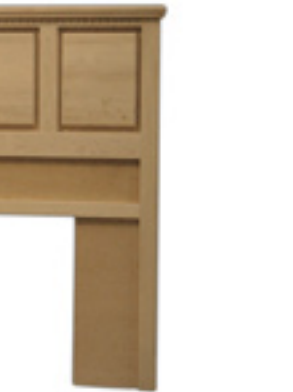
LM_1050/F/XT Full Headboard Xtra tall