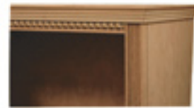
Traditional Fluted Rope/TFP