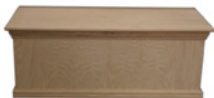
LM_1000 Storage Chest